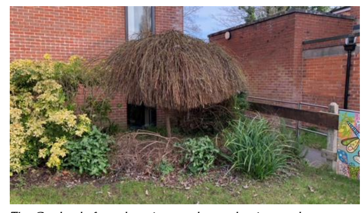
The Garden before alterations and tree-planting are begun

The Anniversary Tree has grown into an Anniversary Garden! This will include two new dwarf trees.