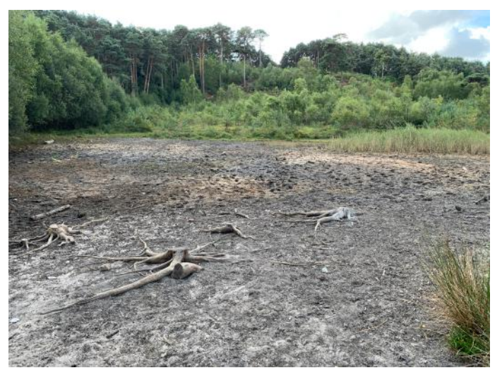
Dragonfly 'pond', Dunyeats Hill Nature Reserve, Summer 2022

this Pivot is published there will be visible changes on the land to the front of the church and that plans will be set out for medium term and longer term objectives for land at the rear. We hold meetings with Eco groups from the other Churches in Broadstone so that we can share information and support one another. The Southampton District of the Methodist Church, of which we are part, is seeking to gain a bronze Eco District Award and in the process will be giving strong leadership. The more we all work together the more we can achieve to protect the precious gifts of creation.