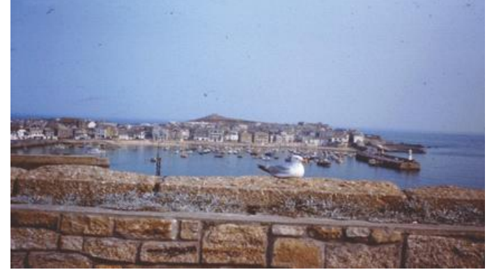
St Ives harbour. Cornwall

In our role as pastoral co-ordinators at BMC we have realised very strongly that people need people. One of the things that has been obvious during the pandemic is that what almost everyone wanted more than anything was to be able to meet with others, be they family or friends. Our social lives became seriously curtailed and lockdown prevented us from visiting each others' homes.