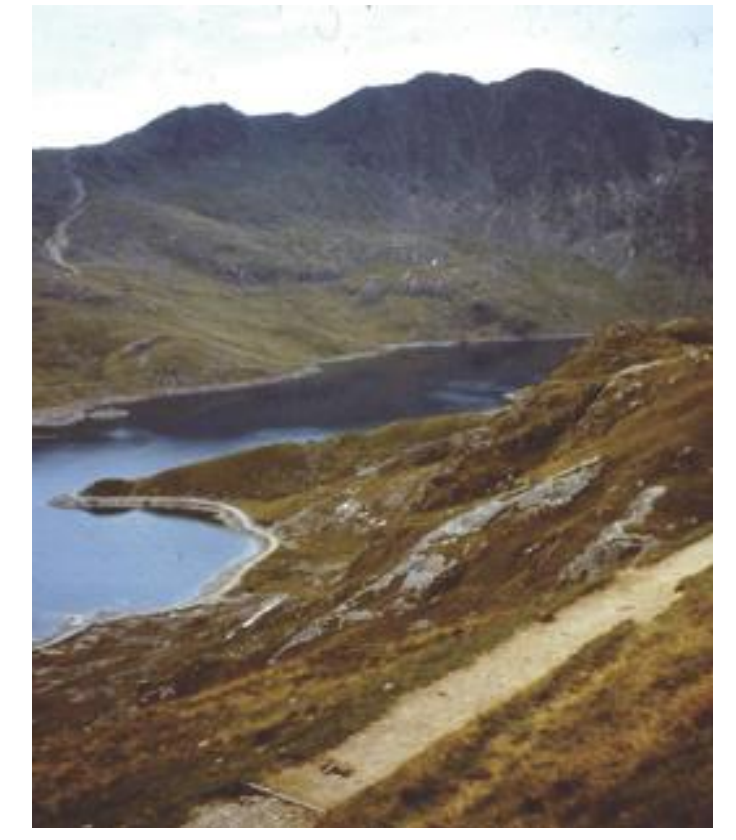
Mount Snowdon in North Wales

It is perhaps the faces of our friends and family that we treasure most. Looking back at pictures of ourselves and our own children as babies makes us realise how the years have sped by. Other pictures capture the faces of loved ones we see no more. How many hundreds of people have we known over our lifetimes!