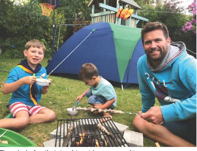
The whole family joined in with camp cooking

Of course, this is what Scouts love to do most but our resourceful leaders found other ways to engage our young people and their families in exploring