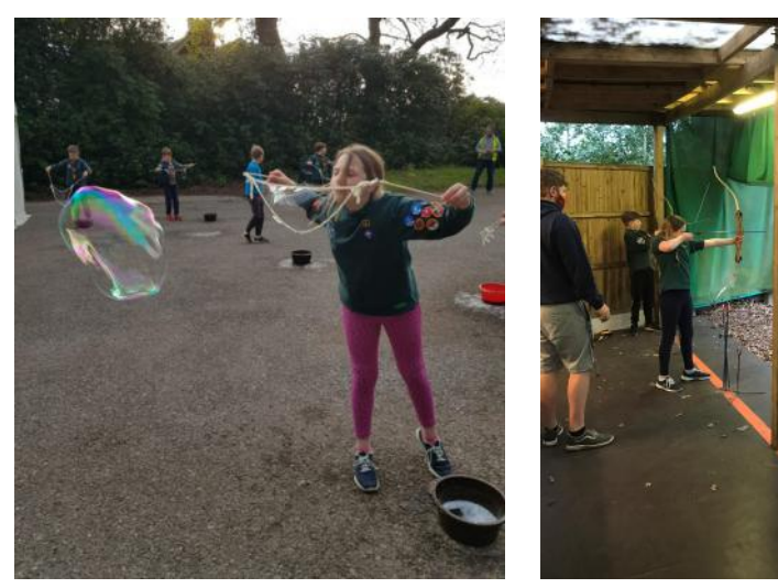
A socially distanced evening playing with bubbles

Supporting our own community We understand how important the local Remembrance Day commemorations are for members of the community. Some of you might have seen the video that we produced and circulated amongst our local community – I know that many people in Broadstone were grateful to have the chance to reflect on those that have served our country, not only in war, but during the pandemic as well.