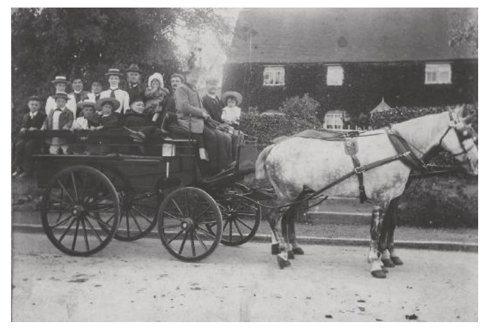
A family outing, Gillingham Dorset, circa 1900

As for the photographs... much has been achieved but we still have many of the oldest ones unsorted families are large and complicated. We now have a very small immediate family but it is good to be reminded that reaching back into the past there are many branches all with their own story to tell.