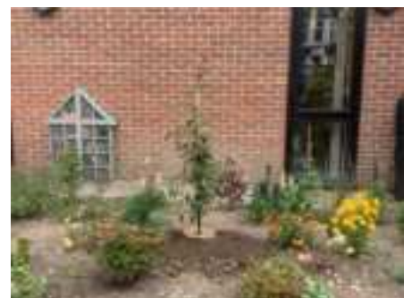
Wildlife is attracted to the bare soil and the luxury 20-room bug hotel and we have our first crab apples