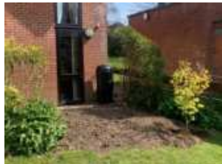
The Acer was chosen and planted