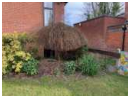
The Starting Point