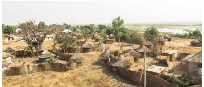
Open Doors UK reports that one Christian was killed and at least sixty kidnapped after a group of bandits stormed a church in Kaduna State and is the latest in a string of kidnappings in Nigeria with Islamic militants and armed bandits targeting people with increasing impunity

For evil to triumph, it is only necessary for good people to do nothing. Edmund Burke.