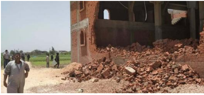
3000 Egyptian Christians without a church after illegal demolition