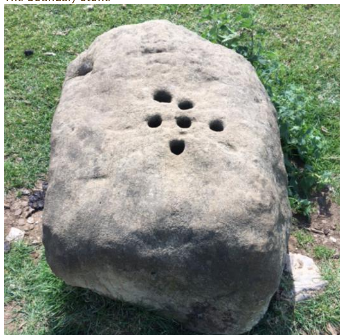
The Boundary Stone

During the Plague of 1665 and 1666 the villagers displayed great sacrifice and heroism going into their own lock down. The plague came to the village in August 1665 on some cloth, infected with fleas from London. The rector persuaded the villagers to stay put in the village and not infect the surrounding communities. About 260 people died, about one third of the population of the village. Coming so soon after our own lock downs of the last few years, it was hard on not to draw comparisons. But the village was not forgotten about during the plague, for the neighbouring village of Stoney Middleton would leave food and messages for the people at the boundary stone, high above the hill of both villages.