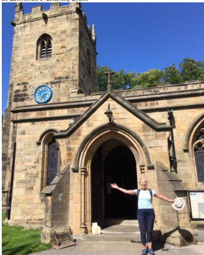
St Lawrence's Church, Eyam

Over the years I've done a lot of walking, which has included urban walking, mountain walking and coastal walking, but I had never walked in this area before. After the last few years with the sacrifices and restrictions of covid, I was keen to visit the inspiring village of Eyam.